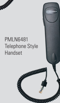
PMLN6481 Telephone Style Handset