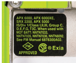
ASTRO 25 Radio Label example